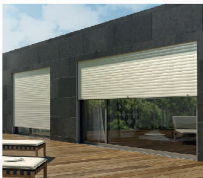
AUTOMATIC ROLLER SHUTTER