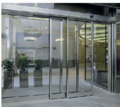
AUTOMATIC TELESCOPIC DOORS