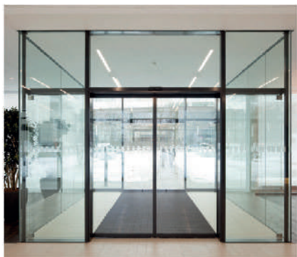
AUTOMATIC SLIDING DOORS