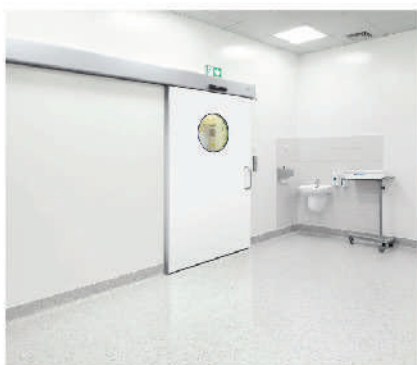
AUTOMATIC HERMATIC DOORS