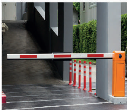
AUTOMATIC GATE BARRIER