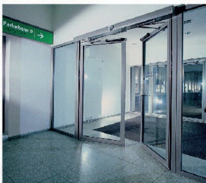
AUTOMATIC SWING DOORS