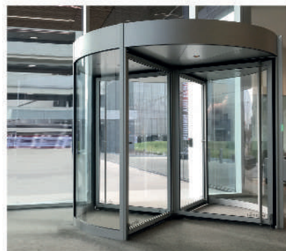
AUTOMATIC REVOLVING DOORS