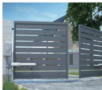
AUTOMATIC SWING GATE