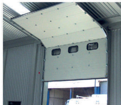
AUTOMATIC SECTIONAL DOORS